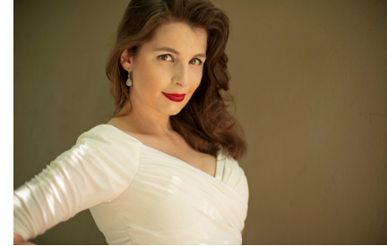
Our Shared Lens

104 pages, 5 x 7, 14 color images 978-0-8071-7929-1 Hardcover $19.95 Foodways / New Orleans